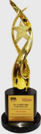
SNN Estates Developer Of The Year 23 Awarded by ET Awards