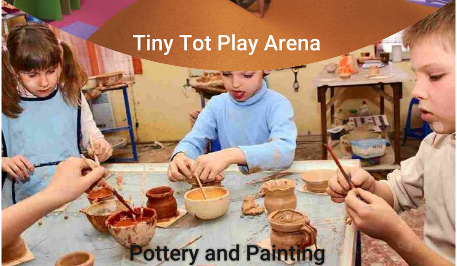
Pottery and Painting