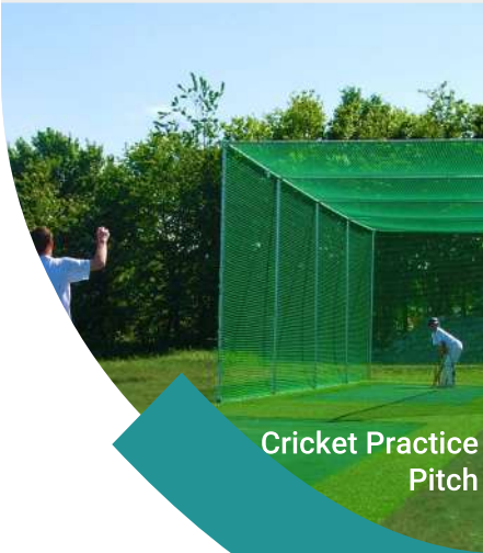
Cricket Practice Pitch