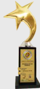
SNN Raj Eternia "Best Luxury Project" by CMO Asia Leadership, Dubai