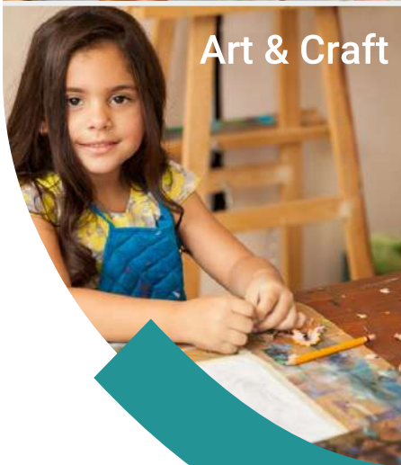
Art & Craft