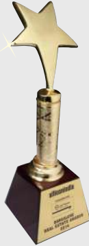
SNN Builders 'Fastest Growing Real Estate Company in Bangalore' By Siliconindia Awards