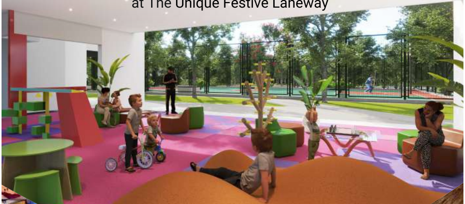
Tiny Tot Play Arena

is enjoying all activities with Family, Friends & Neighbours at The Unique Festive Laneway