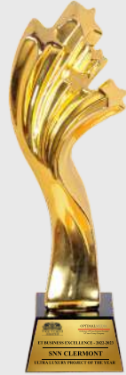
SNN Clermont Awarded Ultra Luxury Project Of The Year 22-23 by ET Awards